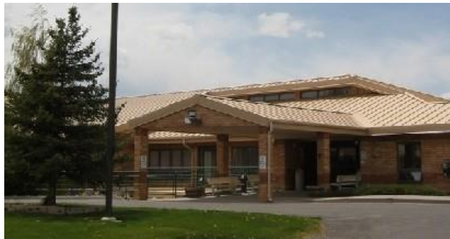
Colorado State Veterans Home at Rifle