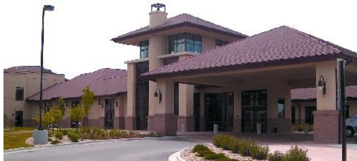
Colorado State Veterans Home at Fitzsimons

Colorado has 5 state veterans' homes located in Aurora, Florence, Homelake, Rifle, and Walsenburg as indicated on http://vets.dmva.state.co.us/?page_id=475 and pictured below. For detailed information on each refer to https://sites.google.com/a/state.co.us/cdhs-velc