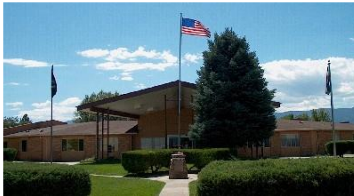
Bruce McCandless Colorado State Veterans Home in Florence