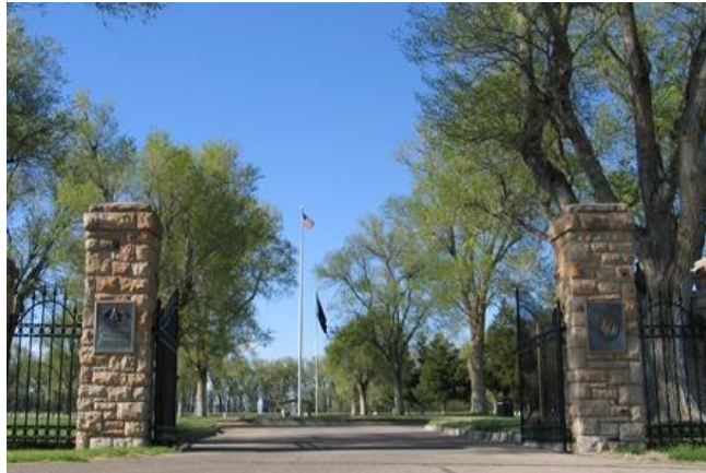
Front gate at Fort Lyon National Cemetery.

Fort Lyon National Cemetery. Located in southeast Colorado, approximately five miles from the town of Las Animas at 15700 County Road HH Las Animas, CO 81054 Tel: (303) 761-0117/781-9378. Fort Logan National Cemetery is responsible for all administrative functions, including the scheduling of burials. Comprised of 52 acres, only 11 acres are currently developed and the cemetery is expected to have burial space for approximately the next 30 years.