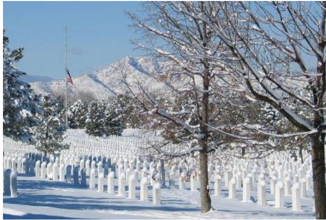
Fort Logan National Cemetery after a snowfall.

Fort Lyon National Cemetery. Located in southeast Colorado, approximately five miles from the town of Las Animas at 15700 County Road HH Las Animas, CO 81054 Tel: (303) 761-0117/781-9378. Fort Logan National Cemetery is responsible for all administrative functions, including the scheduling of burials. Comprised of 52 acres, only 11 acres are currently developed and the cemetery is expected to have burial space for approximately the next 30 years.