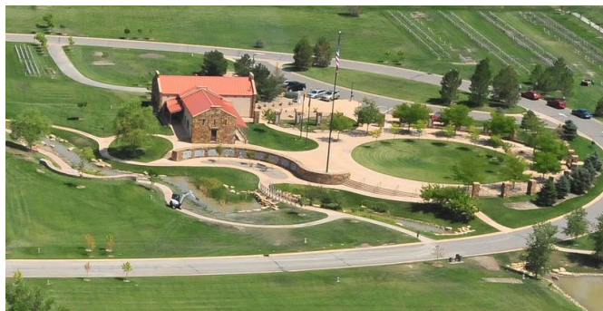
Veterans Memorial Cemetery of Western Colorado