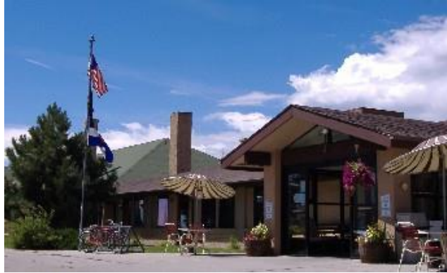
Colorado State Veterans Center at Homelake